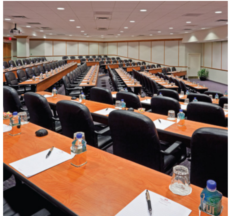
Liberty Conference Center Amphitheater

Dinner Buffet - Served in Stirling's Restaurant. Includes: Salad Bar, Soup of the Day, Two Hot Station Items, Two Hot Side Items, Chef's Selection of Desserts, Regular & Decaffeinated Coffee & Tea, Assorted Cold Bottled Beverages.