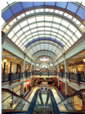
The King of Prussia Mall

The Crowne Plaza Philadelphia Valley Forge is perfectly situated directly across from The King of Prussia Mall, the largest enclosed retail shopping mall in the United States. Valley Forge National Historical Park, site of Washington's troops winter encampment during the Revolutionary War, is located less than two miles away. Downtown Philadelphia is less than 20 miles away.