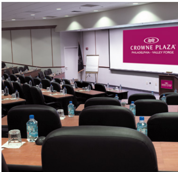
Valley Forge Amphitheater

MEMBER INTERNATIONAL ASSOCIATION OF CONFERENCE CENTERS-NORTH AMERICA