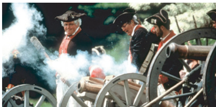
Valley Forge National Park